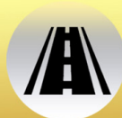
Black Top Road